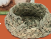
Living World Green Naturals Nesting Material & Bed Perfect nesting & resting spot. Safe to chew